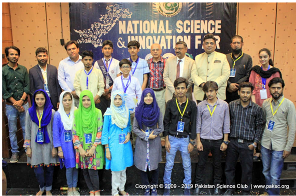
Prior to the event, a series of workshops was conducted to spread awareness about the event and to encourage talented young students to participate and bring out their talent to make this world a better place. The workshops were not only conducted in schools and colleges but online sessions were also carried out by PSC for the guidance of students in far flung areas.

National Science & Innovation Fair 2019 was successfully organized by ECO Science Foundation (ECOSF) and Pakistan Science Club (PSC) in collaboration with Usman Institute of Technology (UIT), Pakistan Science Foundation (PSF) and others. The purpose of the Fair was to provide an opportunity and exciting challenge to the students of aged 12-20 years to participate and display their novel ideas and projects. The science talent searched through NSIF'19, would represent Pakistan at international level mainly in the 34<sup>th</sup> China Adolescent Science, Technology and Innovation Competition (CASTIC) to be held in 3<sup>rd</sup> week of July 2019 at Macao- P.R. China. Participants from all over the country were invited to present and contest their independent research in various fields of science and technology for the solution of local and global science and engineering issues. NSIF not only contributed towards the social development of the participants but also helped them to think in a rational way to explore the possibilities for the betterment of society using scientific concepts and innovative approaches.